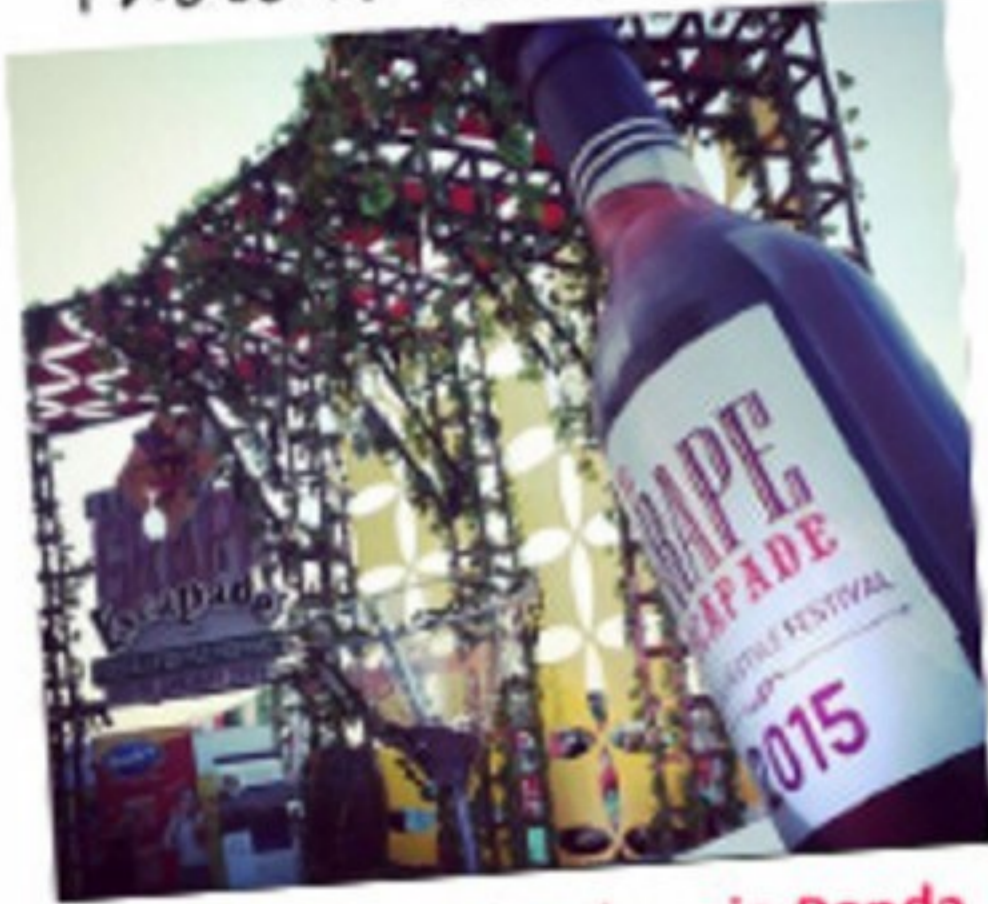
Christmas Celebrations in Ponda